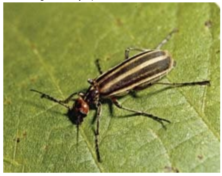
Blister beetle: Photo: Clemson University/USDA Cooperative Extension

Blister beetles are something we usually think about in hay. These beetles contain a chemical that is toxic to horses, and even touching them can poison your horse. Consuming too many can cause death, so this is something you need to be aware of. Oftentimes horses are exposed to these beetles when they are crushed in the hay making process; they are most often found in alfalfa hay, usually in later cuttings of hay. Your horse would have blisters in their mouth and GI tract if they consume these insects, reduced eating, and colic-like symptoms. Contact your vet immediately if your horse consumes alfalfa hay and starts exhibiting these symptoms.