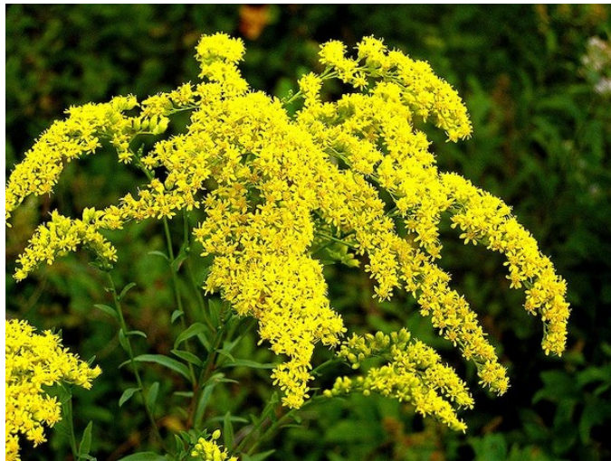
Golden Rod | NC Extension Gardener Plant Toolbox

If you would like to have additional blooming, it is encouraged to deadhead spent flower clusters. There is a lot of potential for this plant to naturally spread quickly throughout the area you place it. So, every 2-3 years it might be advantageous to divide it. You can do so by propagation. This can also occur naturally through wind-driven seeds. However, you can do this manually by dividing the underground rhizomes. With high moisture or warm weather, some of the species produce abundant nectar for attracting bees and other pollinators.