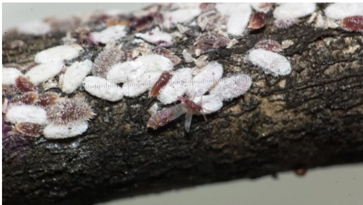
Winged adult crapemyrtle bark scale, nymphs, and male pupae

While they have many colors, shapes, and sizes, insects can be identified through a few anatomical features, such as having three pairs of legs, three main body segments, and a hard exoskeleton. This is why it can be so hard to recognize insect pests such as scale. Scales have waxy covers that greatly distort their appearance and often make them look like bumps on the surface of a leaf or stem. Unlike other inconspicuous insects, such as gall or spittle forming insects, scales tend to be very small and can be difficult to identify with the naked eye.