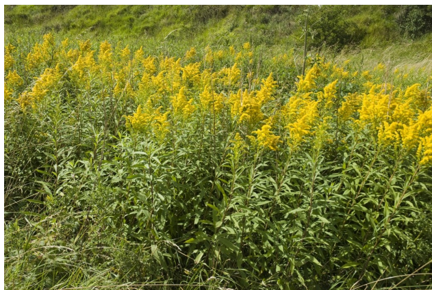
Golden Rod in the Landscape | NC Extension Gardener Plant Toolbox

For more information, you can visit: https://plants.ces.ncsu.edu/plants/solidago/