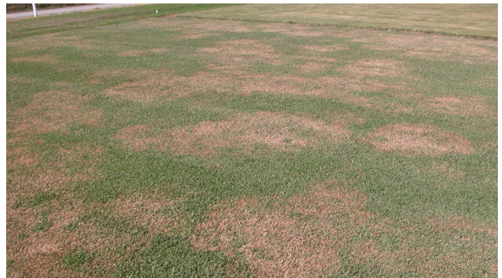
Large Patch in Turf | NC Cooperative Extension Publication

Integrated Pest Management (IPM) strategies for weeds would include applying post-emergence herbicides in May if you are going to control summer annuals or perennial broadleaves. However, it is recommended that you do not apply POST (post-emergence) herbicides until 3 weeks after green-up. Always remember to read the pesticide labels before applying.