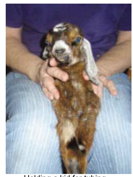
Holding a kid for tubing.